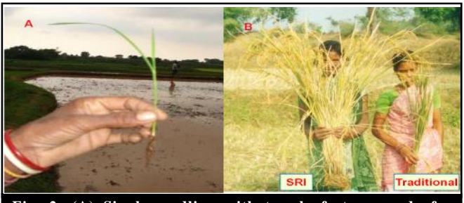
Fig. 2: (A) Single seedling with two leaf stage ready for transplanting (B) Mature rice under SRI and traditional method

- Spacing them widely, at least 25 \times 25 cm and in some cases even 50 \times 50 cm, and in a square pattern rather than in rows, to permit more growth of roots and